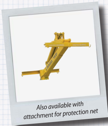
Also available with attachment for protection net

Automatic adjustment with telescopic loading height.